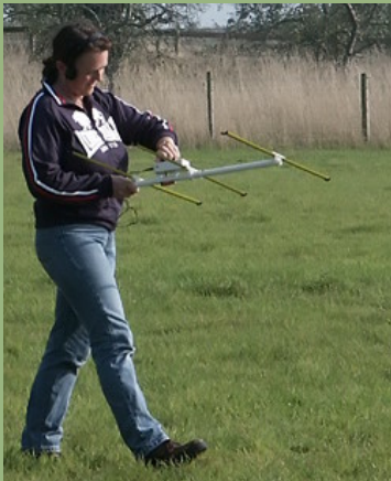
RDF or FOX HUNT Even the parents had a go at it !